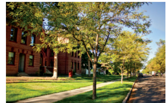
Rocky Mountain Treatment Center Located in a historic neighborhood of beautiful Great Falls,

Family week runs all day Monday, Tuesday and half day Wednesday. During this process, you will be sharing emotions that most likely have not been dealt with in an extended period of time. Please be prepared to confront and forgive as this is a healing process not only for your loved one’s benefit, but also for the entire family.